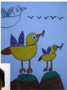
by Ashish, Class 5

at: http://namastesate.blogspot.com/2012_09_01_archive.html .