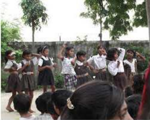
Celebrating Independence Day, August 15th

Although here in the United States school is just getting underway, at Asha Deep our first term will soon be at an end. School began on the first week of July, and first term exams will be administered later this month. Some topics already studied include our body, colors, monsoon, India since independence, and diet.